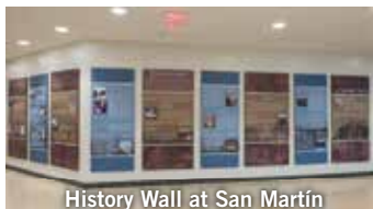
History Wall at San Martin