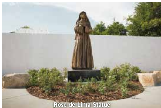
Rose de Lima Statue