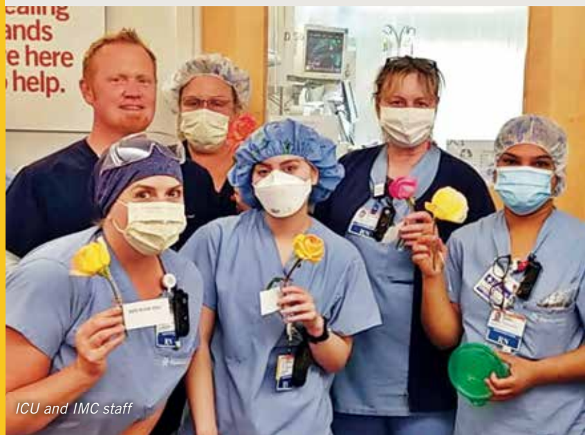
ICU and IMC staff