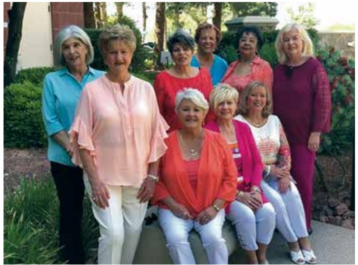
2021 Rose Bud Auxiliary Board of Directors

Rose Bud Auxiliary members will also enjoy the opportunity to gather at less formal events and hold a number of mix and mingle events at a variety of local venues. This will give the auxiliary members an opportunity to socialize and participate in some fun fundraising opportunities. The group will conduct donation drives for the Kindness Klostet and other hospital programs that provide clothing and supplies to patients in need at the Siena Campus. There will also be outreach efforts in the communities near Sun City Anthem to increase membership and attendance at their fundraising events.