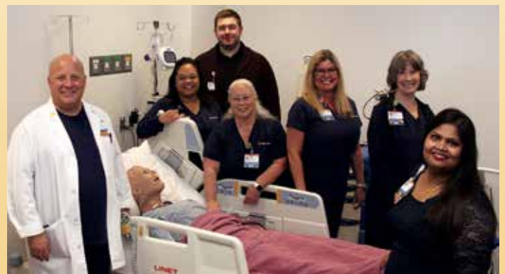
Medical Simulation Center Team