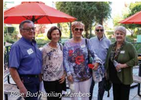
Rose Bud Auxiliary Members