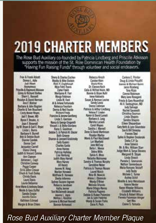
Rose Bud Auxiliary Charter Member Plaque