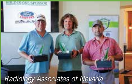
Radiology Associates of Nevada

On Monday, October 17, St. Rose kicked off the 25th Annual “Swing for St. Rose” Golf Tournament at SouthShore Country Club. It was a huge success as more than 100 golfers arrived to hit the links. Golfers were provided a gift bag, concept shop gift card, cart, access to the driving range, putting green, boxed lunch, putting contest and awards reception. The program also included silent auction items for guests to bid on, a wine grab with a chance to win a grand prize, and over 30 items in the ticket drop.