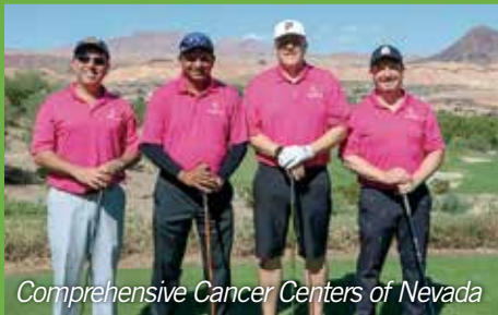
Comprehensive Cancer Centers of Nevada